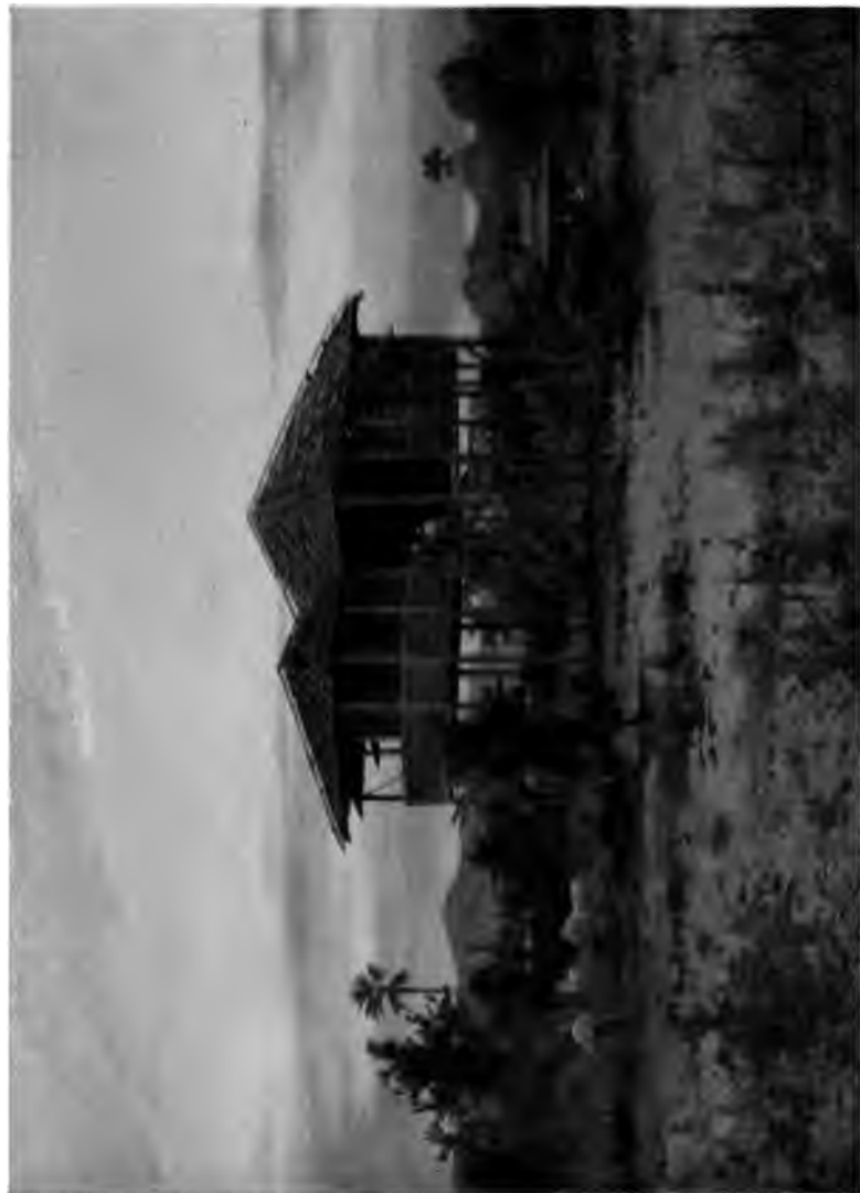
A DAK BUNGALOW. Price Co.